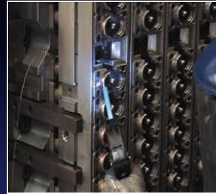
Clean molds hot and in place with Cold Jet Dry Ice Blasting.