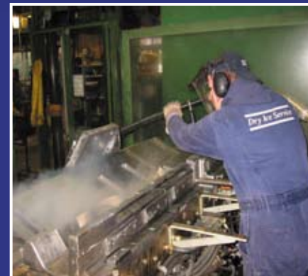
Cold Jet's non-abrasive process will not damage molds.