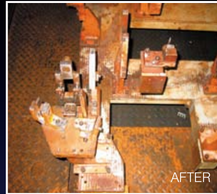
Automotive Weld Line cleaning.