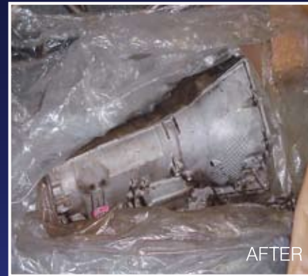
See the difference. Transmission housing cleaned with Cold Jet.